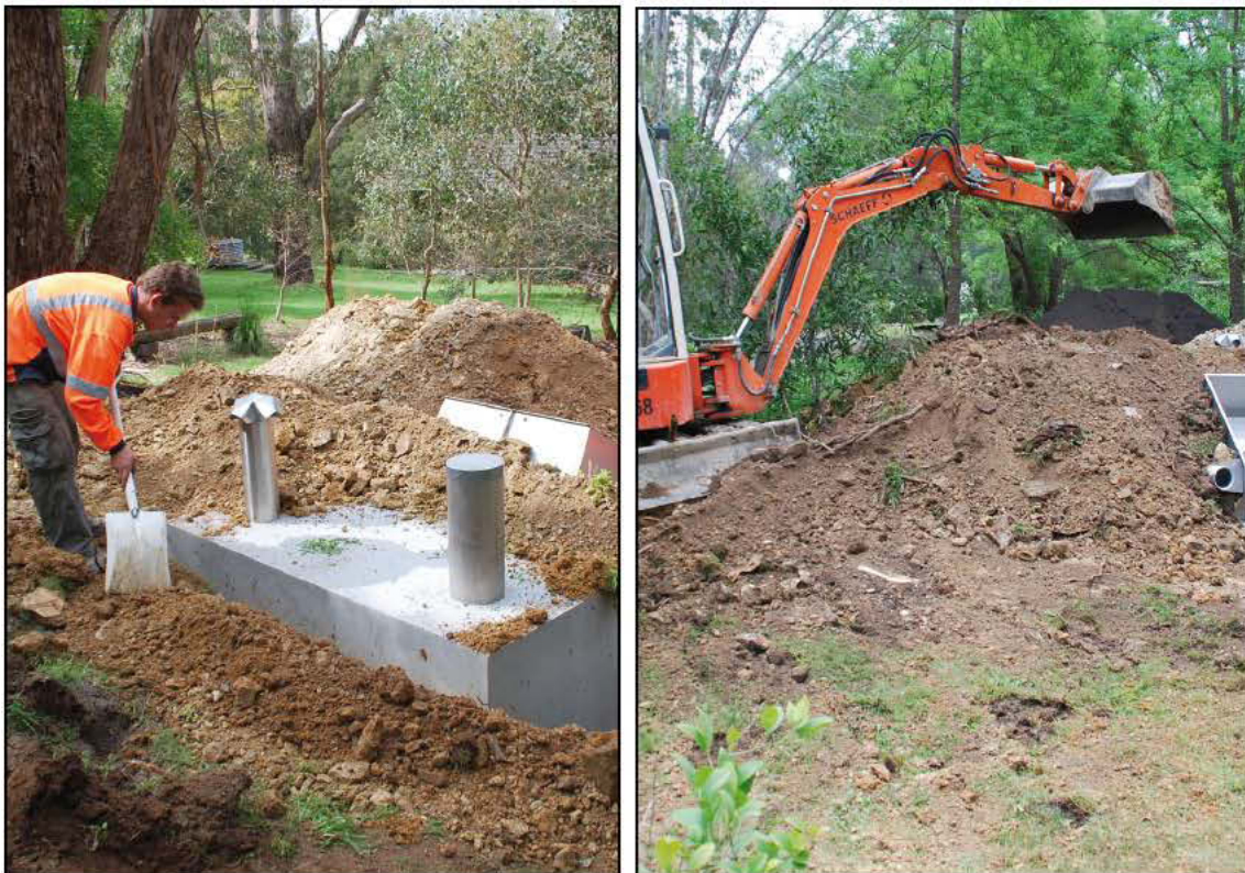
Avoid heavy machinery close to the edges of the bunker.

The mounding over the bunker will need attention over time due to erosion. Always maintain the minimum and maximum earth cover over the bunker at all times. This remains the responsibility of the home owner. The home owner could also contract the services of a landscape gardener for this work.