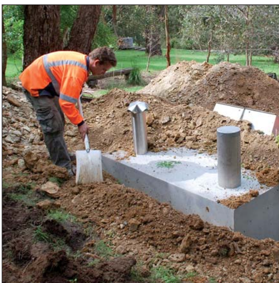
Compacting by hand.